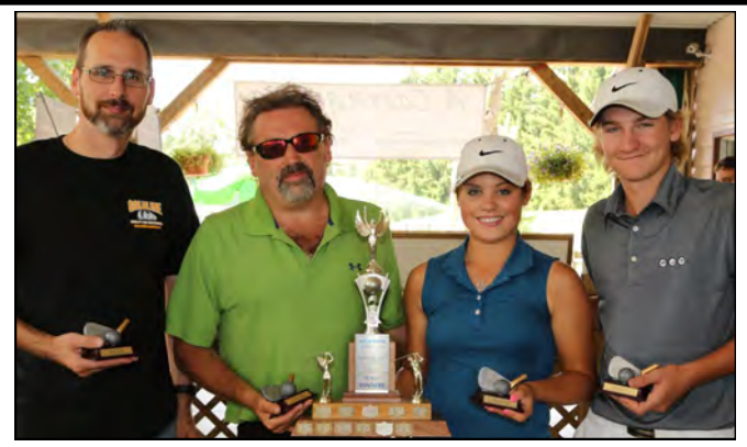
Overall winners: Team Goldline Mobility and Conversions!

The 2013 Leo Kirwin Golf Tournament Committee