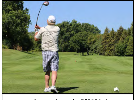
... unless you're at the $5000 hole ...