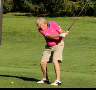
... give it your all ...