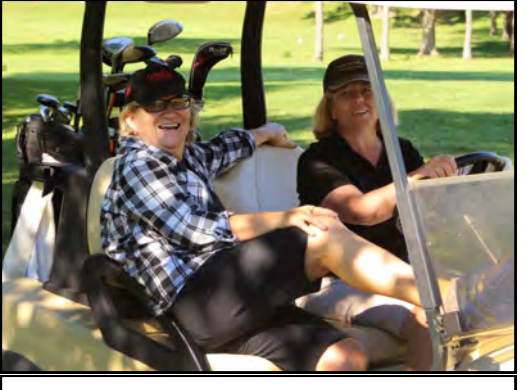
... but enjoy the ride...