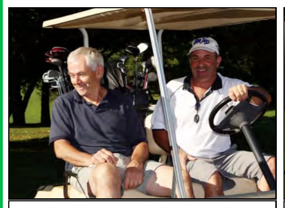
An enthusiastic start...