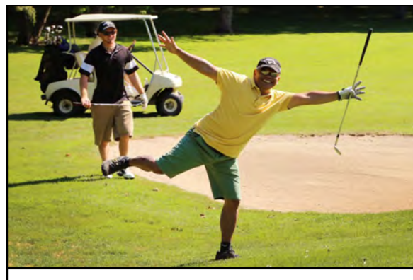
... don't take yourself too seriously ...