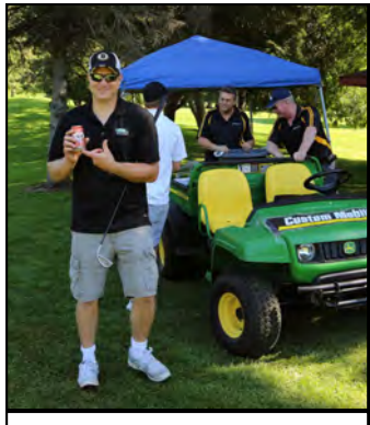
... keep refreshed...